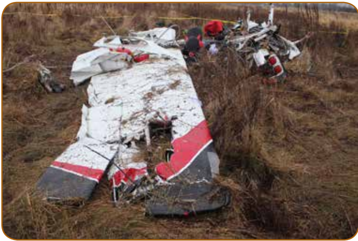
Wreckage of Cessna Cardinal 1.9 NM west of the threshold of Runway 07 at CYOW

On December 14, 2011, a privately owned Cessna 177A Cardinal departed Wilkes-Barre Wyoming Valley Airport (KWBW), Pa., USA, with two persons on board, on an IFR flight plan to Ottawa/Carp Airport (CYRP), Ont. Approximately 44 NM from destination, because of low visibility and ceilings at destination, the aircraft diverted to its filed alternate of Ottawa/Macdonald-Cartier International Airport (CYOW), Ont. The aircraft was then cleared for an ILS approach to Runway 07. At about 19:12 (all times quoted are EST), while flying the approach in instrument meteorological conditions (IMC) at night, the aircraft collided with the ground approximately 1.9 NM west of the threshold of Runway 07. The aircraft was destroyed, and both occupants were fatally injured. There was no fire. The 406 MHz ELT activated on impact.